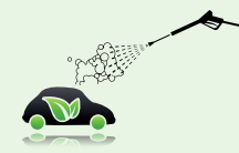
Small wash size