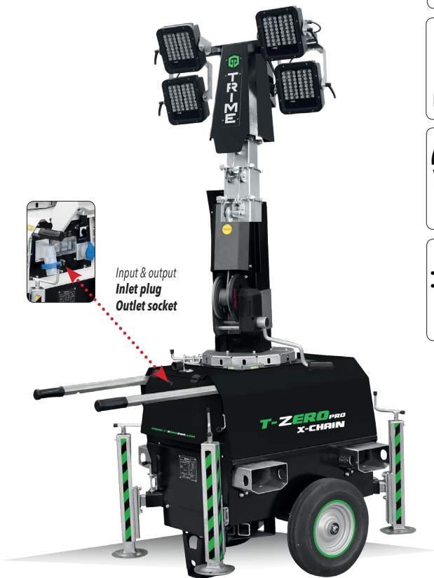
Input & output Inlet plug Outlet socket